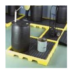
Flammable Liquid SOP 10-25